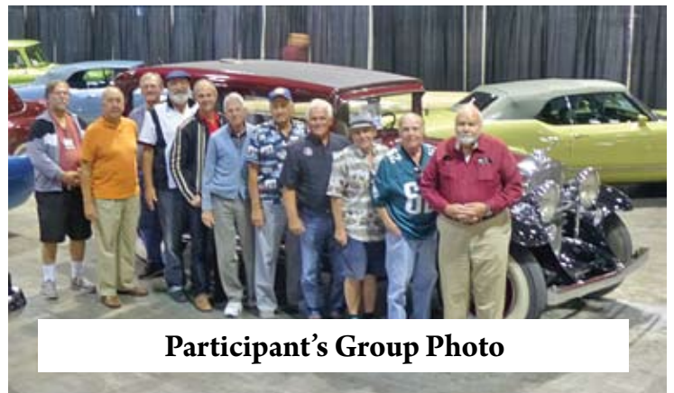
Participant's Group Photo

The 5 former/non-AACA member cars were a 1934 Chevrolet Roadster Pickup, 1947 Lincoln 1957 Chevrolet 3100 Pickup, 1962 Dodge Custom 300, 1965 Chevrolet C-10 Pickup