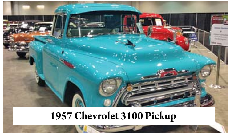
1957 Chevrolet 3100 Pickup