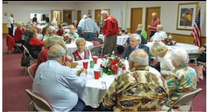
The catered dinner menu was a big hit.