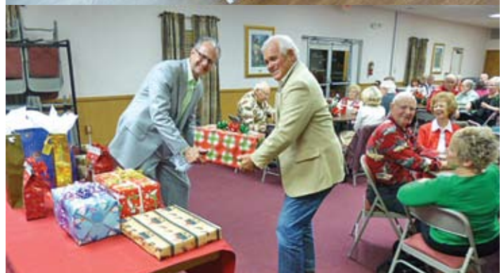
The Chinese gift exchange is underway.