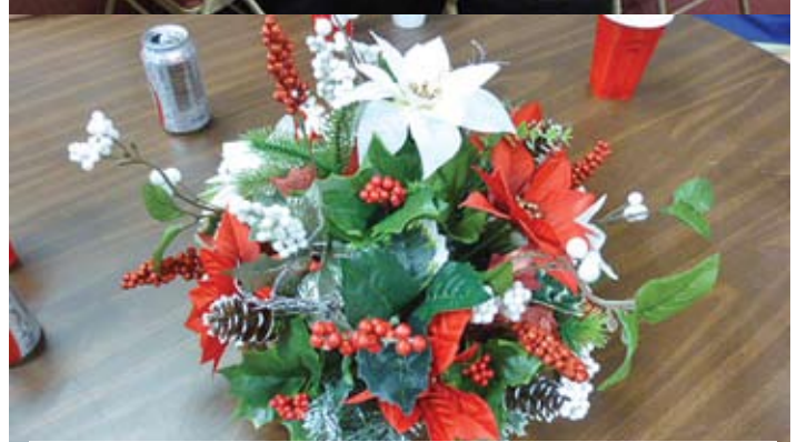
Dot Clark donated the table centerpieces.