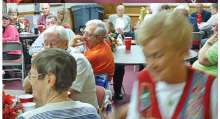
A sack full of toys were donated to needy kids.