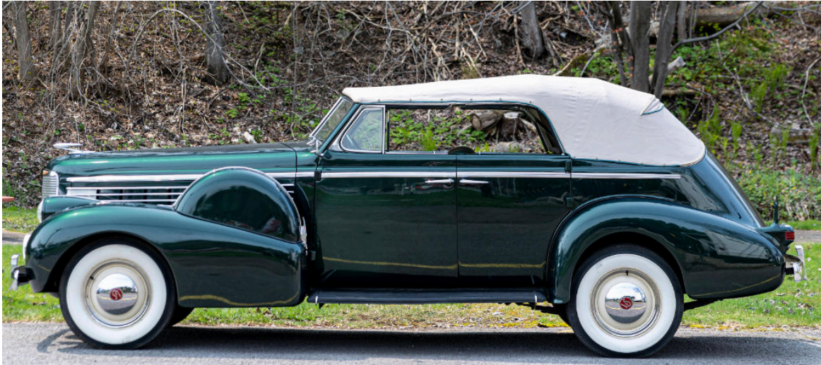
1938 LaSalle Series 38-50 Convertible Sedan

Published Monthly in the Interest of the Preservation of Antique Motor Vehicles