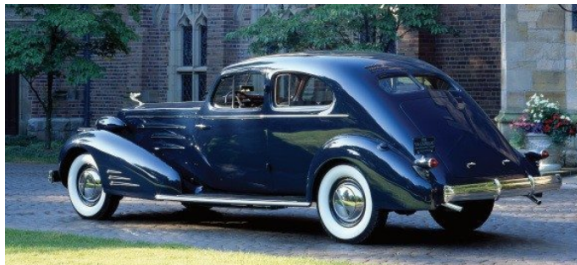
1933 Cadillac V16 Aero-Dynamic coupe.