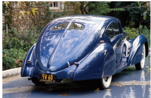
1937 Delage Aerodynamic Coupé

Autobahn KurierMercedes-Benz stylists were enthralled with the possibilities of aerodynamics as they applied to road cars. The first example from the factory appeared in 1934, the 500K Autobahn Kurier sport limousine (in Germany at the time, four-door sedans were called limousines) establishing a body style that would carry on into the 540K series, and the striking 1935 Type 290 and 1937 Type 320 streamliners.