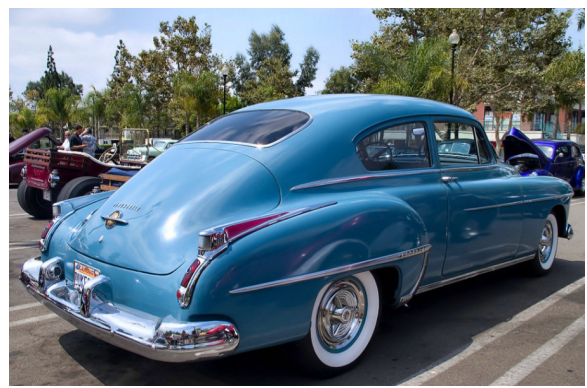
1950 Oldsmobile Rocket 88