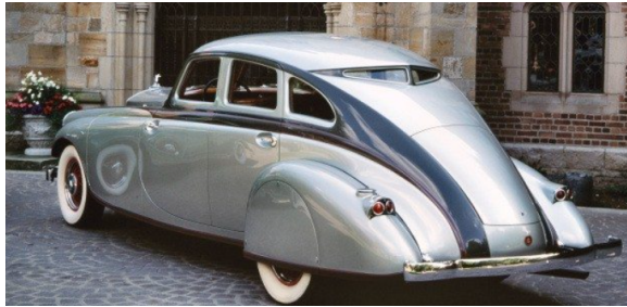
1933 Pierce-Arrow Silver Arrow

were tapered at their rear and the hood vents were shaped like airfoils.