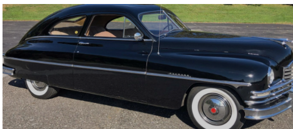
1949 Packard Deluxe Eight Club Coupe