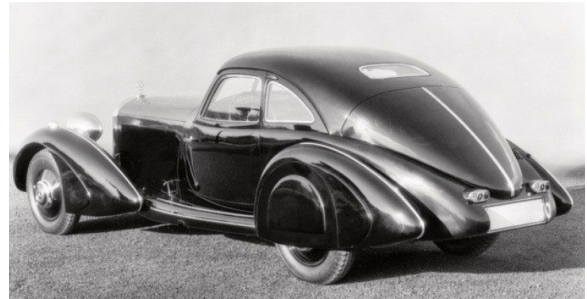
1934 Mercedes-Benz 500K

designs well into the 1940s but automotive styling the world over.