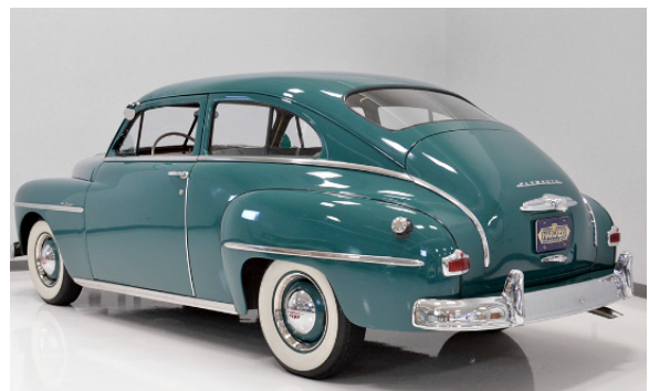
1950 Plymouth Deluxe Fastback