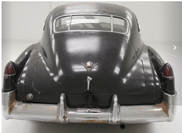
1948 Cadillac Series 61