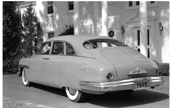
1949 Lincoln Cosmopolitan Town Sedan.