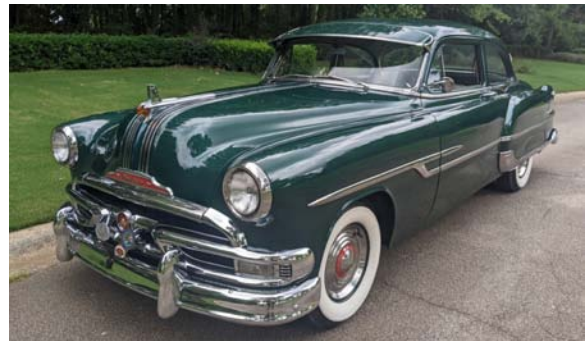
1953 Pontiac Chieftain DeLuxe sold for $15,750 at Hemmings Online Auction October 2022