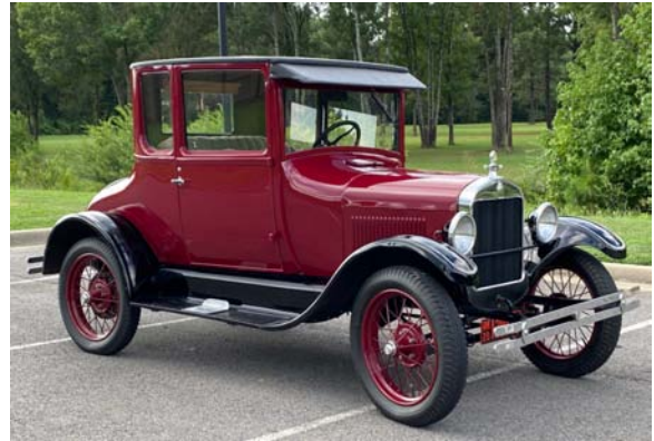
1926 Ford Model T Coupe sold for $13,650 at Hemmings Online Auction October 2022