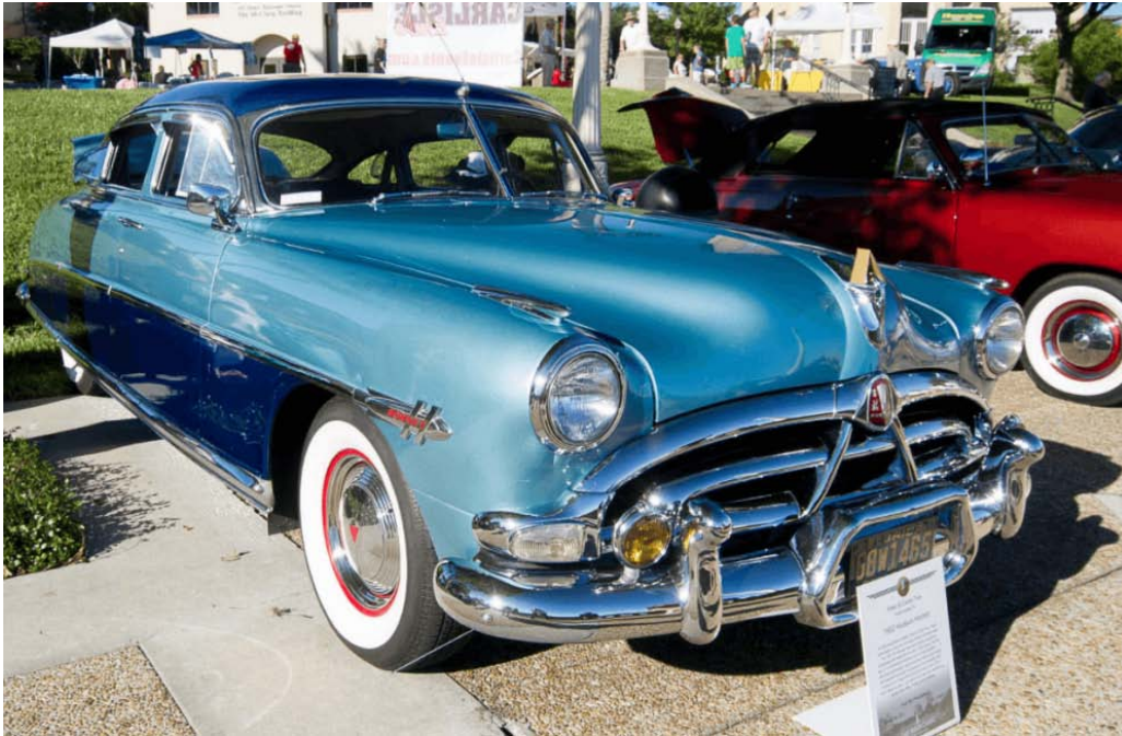
1952 Hudson Hornet

Published Monthly in the Interest of the Preservation of Antique Motor Vehicles