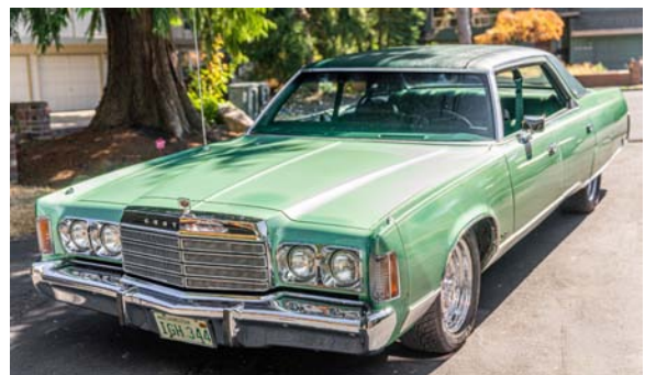
1974 Chrysler New Yorker Brougham sold