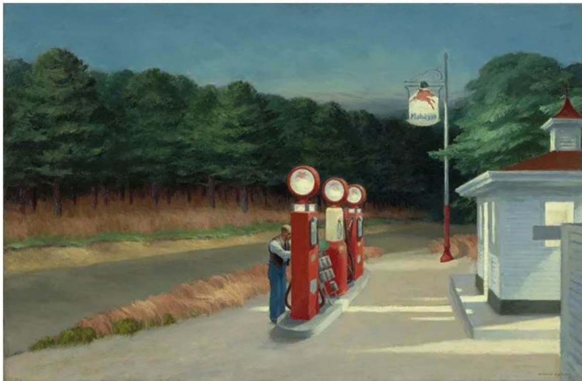
Edward Hopper Gas 1940