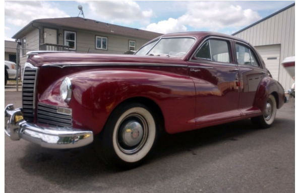
1947 PACKARD CLIPPER SEDAN , Sold at Scottsdale 2020 Jackson-Barrett auction for $7,700