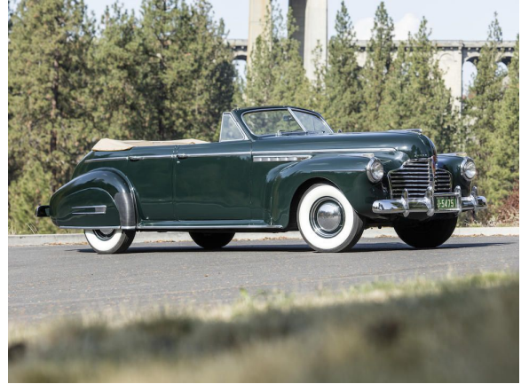
1941 BUICK ROADMASTER CONVERTIBLE PHAETON Sold for $ 30,240