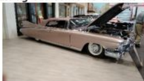
1959 Cadillac Eldorado Biarritz