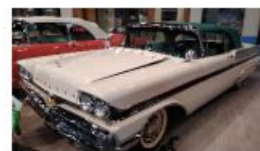
1958 Mercury Turnpike Cruiser