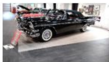
1957 Dodge Custom Royal D500