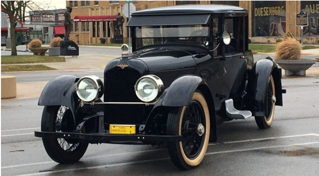
1921 Duesenberg Model A

Published Monthly in the Interest of the Preservation Antique Motor Vehicles