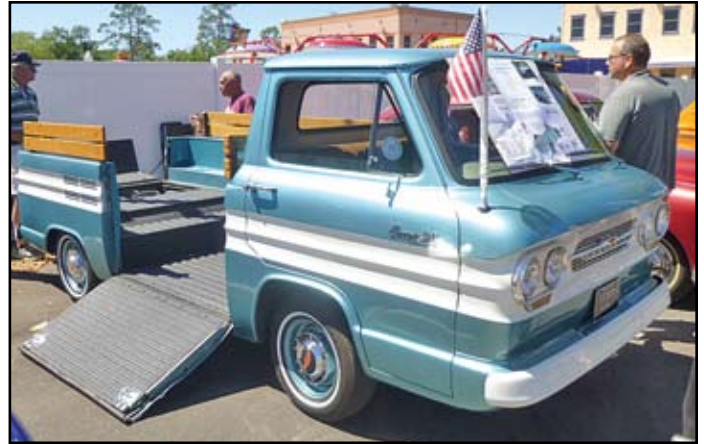
A REO pickup truck

1963 Chevrolet Corvair Rampside Pickup, Model 95. 2,000 produced in 1963, flat 6 engine, rear engine air cooled, 95 HP, 4 speed manual transmission. Unitized body and frame construction. A popular usage for this vehicle was appliance deliveries.