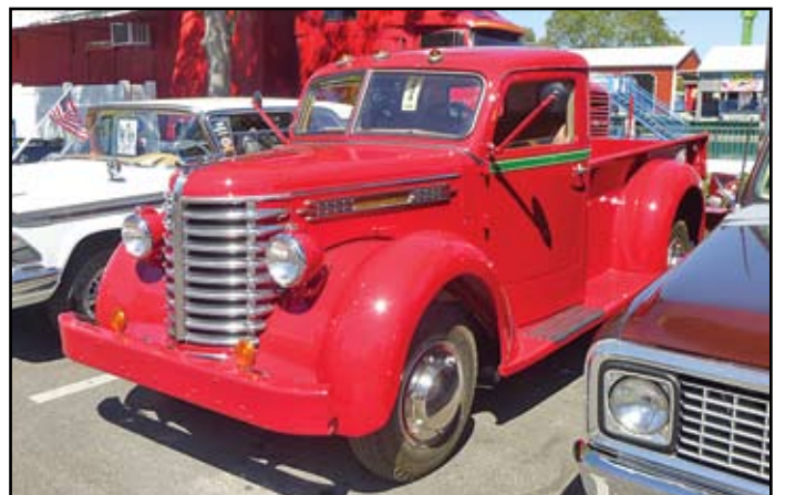
A 1948 Ford Truck, Cab Over Engine