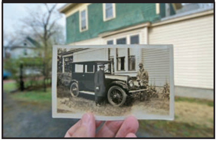
"Grandfather's Franklin in front of his house in 2012"