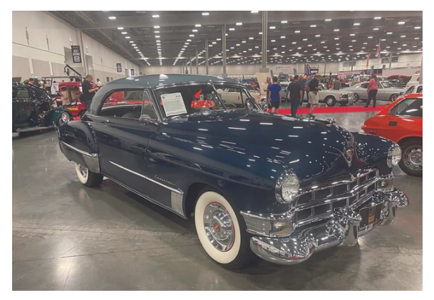
1949 Cadillac Series 62 Coupe De Ville sold for $64,900 on Barrett-Jackson Las Vegas Auction November