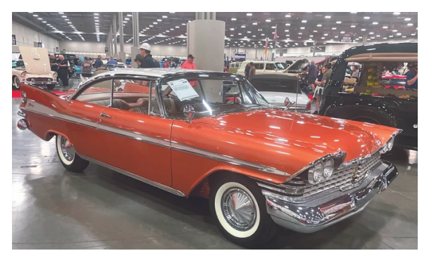
1959 Plymouth Fury Sport sold for $110,000 on Barrett-Jackson Las Vegas Auction November