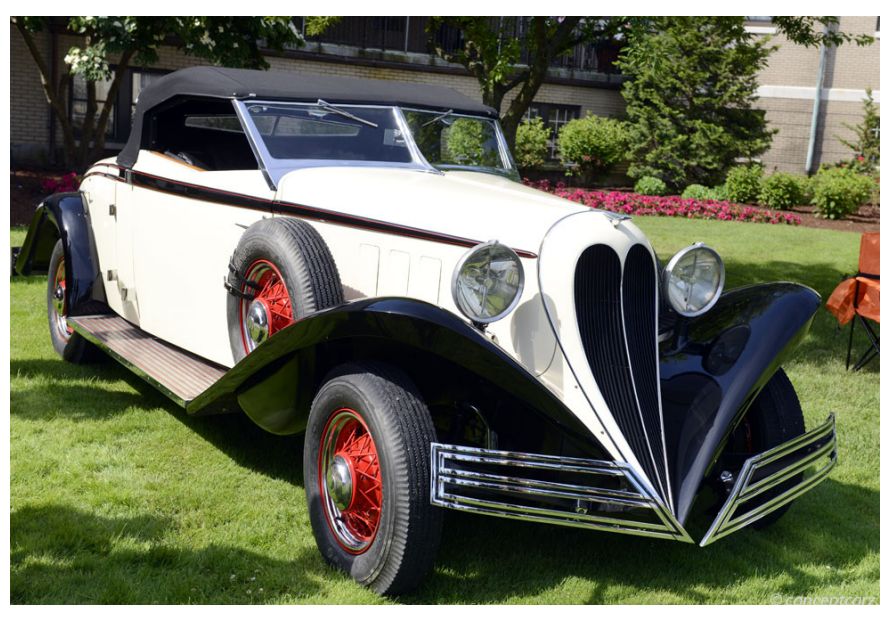
1935 Brewster Ford Convertible Roadster