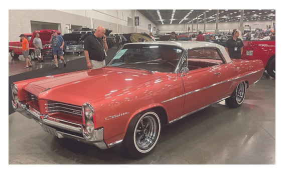
1964 Pontiac Catalina sold for $30,800 on Barrett-Jackson Las Vegas Auction November