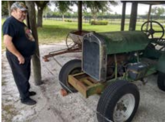
1920 Handbuilt Tractor