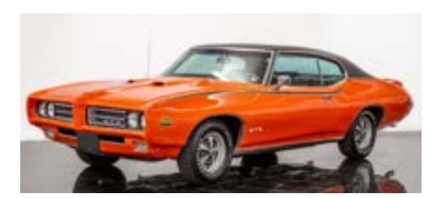
1969 Pontiac GTO Judge Ram Air IV sold for $198,000 at Kissimmee Summer Special Mecum Auction