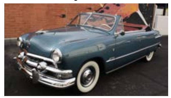
1951 Ford Custom Deluxe sold $43045 at Hemmings Online Auction