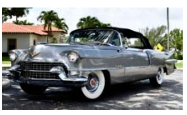
1955 Cadillac Eldorado Convertible sold for $264,000 at Kissimmee Summer Special Mecum Auction