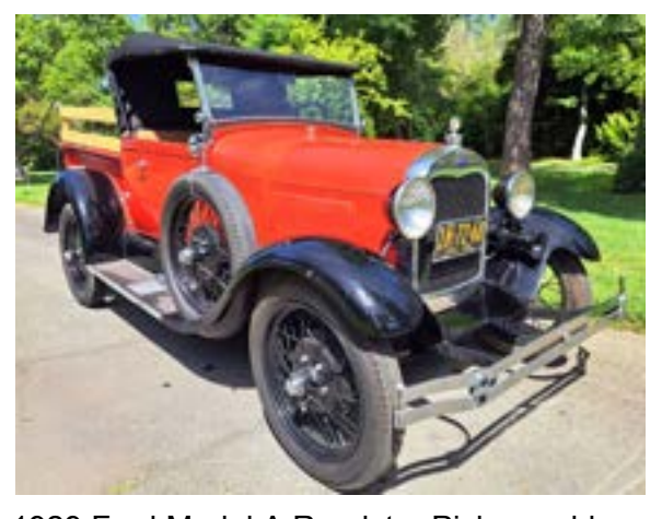
1929 Ford Model A Roadster Pickup sold $17850 at Hemmings Online Auction