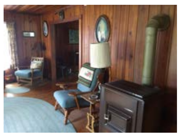
1950's house display at Fort Christmas