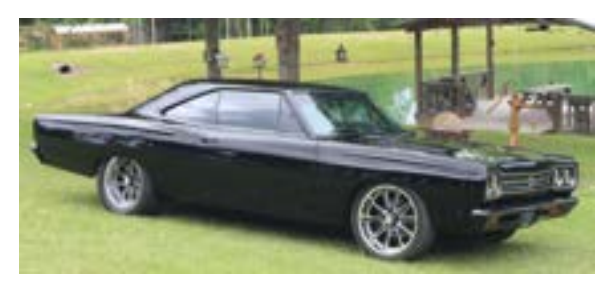
1968 Plymouth Road Runner sold for $264000 at Kissimmee Summer Special Mecum Auction