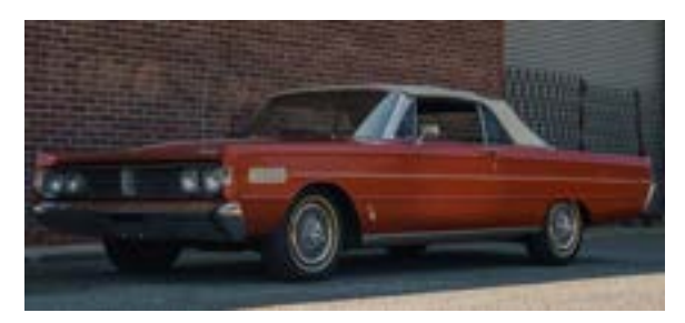
1966 Mercury S-55 Convertible sold $31500 at Hemmings Online Auction