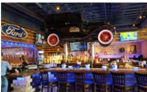
Ford's Garage in Oviedo