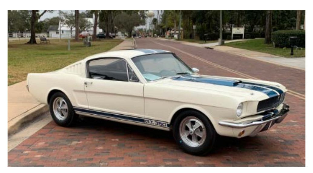
1965 GT350 Shelby- Faren LeJeune

Published Monthly in the Interest of the Preservation of Antique Motor Vehicles