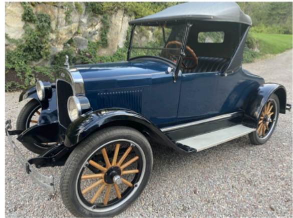
1925 Chevrolet Superior Series K Roadster sold for $10,763 at Hemming Online Auction October 2021