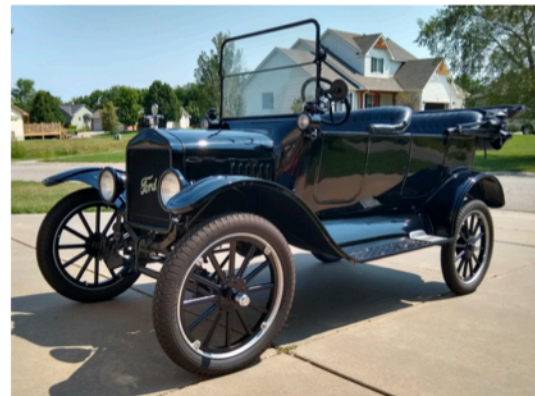
1921 Ford Model T Touring sold for $17,063 at Hemming Online Auction October 2021