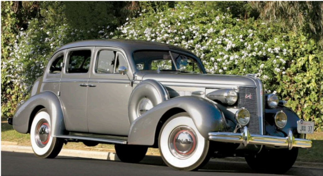
1937 Buick Century

Published Monthly in the Interest of the Preservation of Antique Motor Vehicles