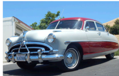
1952 Hudson Wasp sold for $19,173 at Hemming Online Auction October 2021