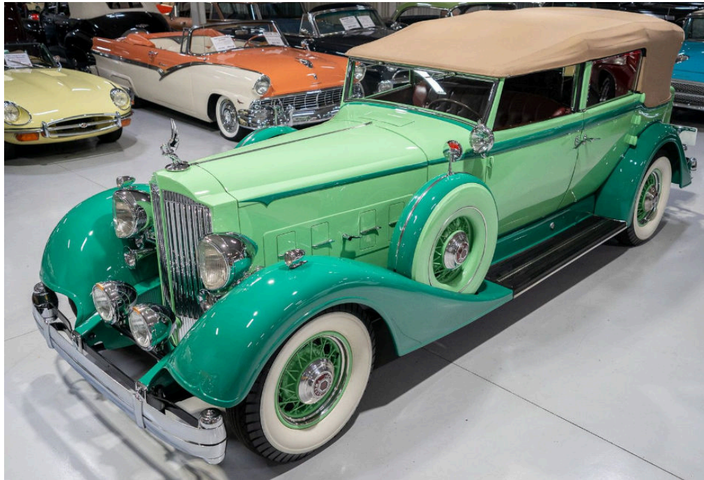
1934 Packard Twelve Dietrich Convertible

Published Monthly in the Interest of the Preservation of Antique Motor Vehicles