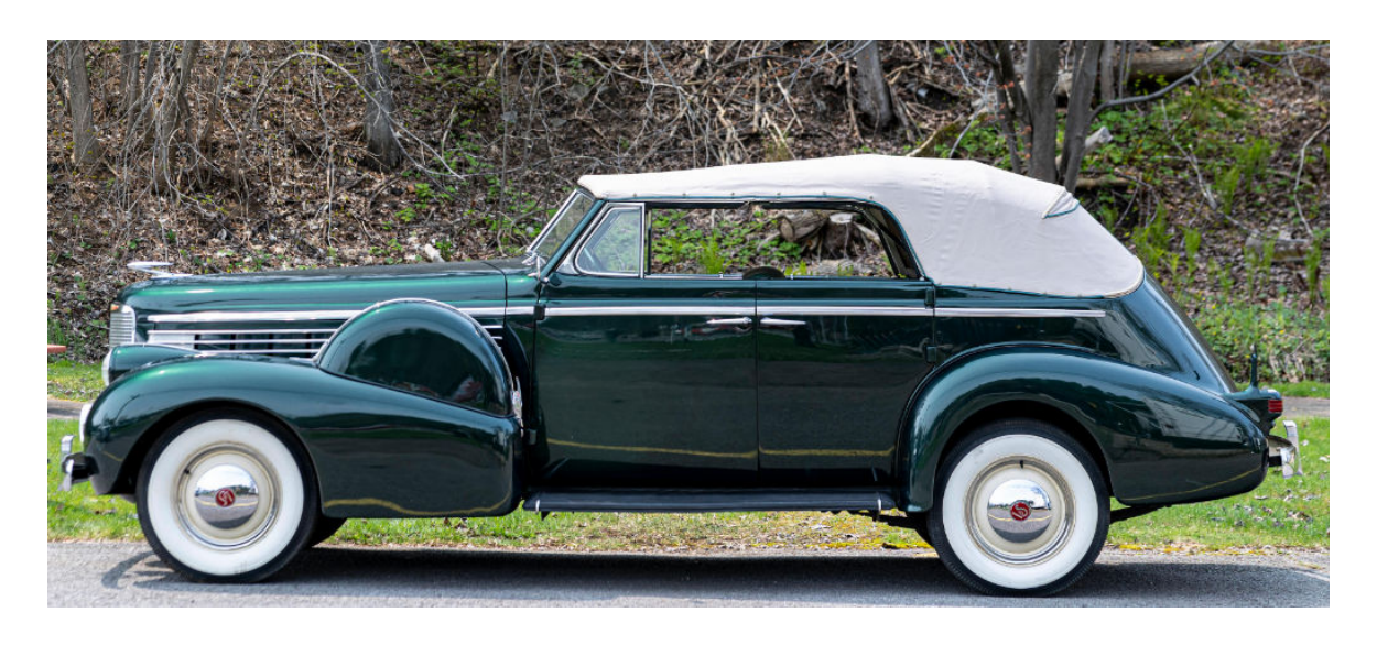
1938 LaSalle Series 38-50 Convertible Sedan September 2024

Published Monthly in the Interest of the Preservation of Antique Motor Vehicles