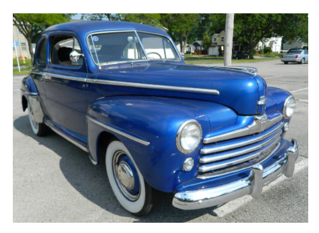
1948 Ford Super Deluxe sold for $9500 on Hemming Online Auction August