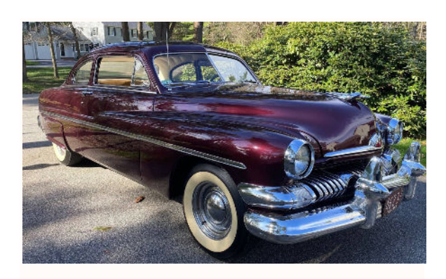
1951 Mercury Sport Coupe for $24675 on Hemming Online Auction August