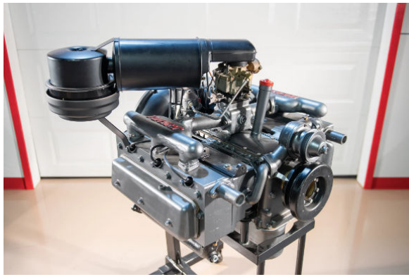
In 1947 Aircooled Motors was purchased for $1.8 million by the Tucker Car Corporation to produce an engine for the 1948 Tucker