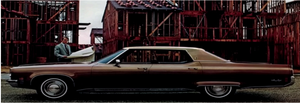
Oldsmobile 98 232.4 inches