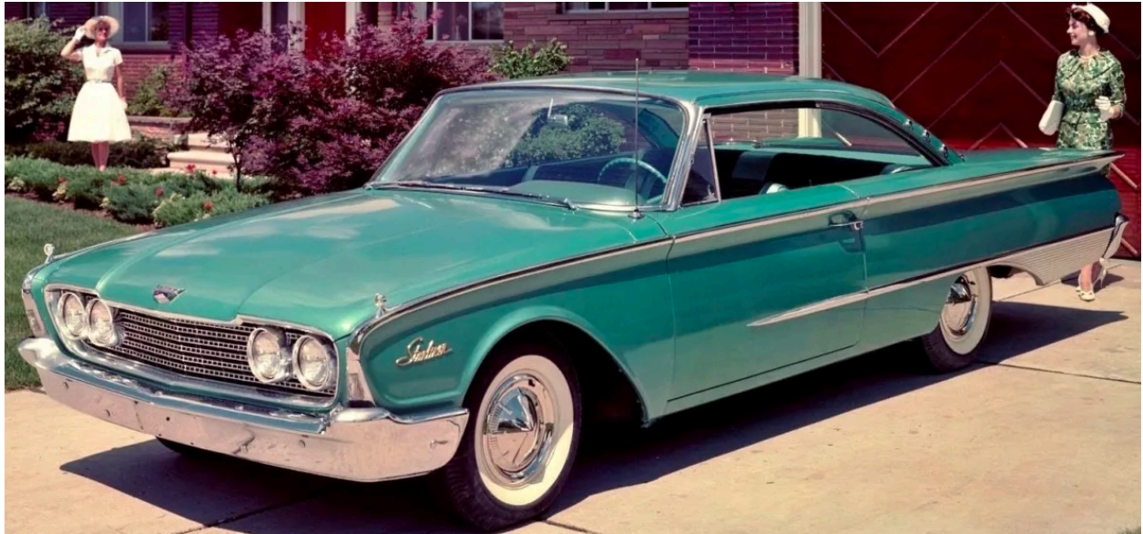
1960 Ford Galaxie Starliner

Published Monthly in the Interest of the Preservation of Antique Motor Vehicles