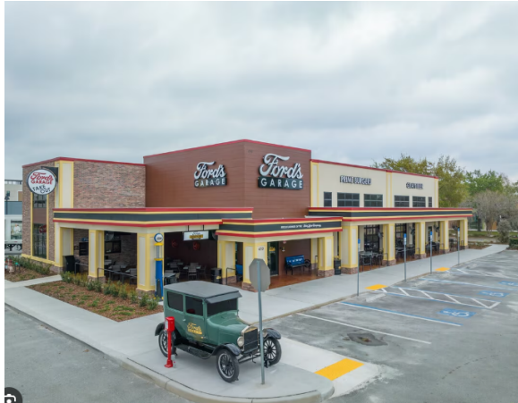
Ford's Garage in Oviedo