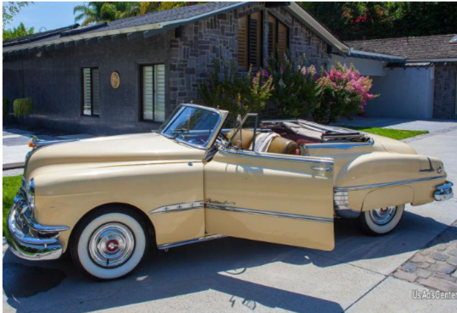
1950 Pontiac Chieftain

Published Monthly in the Interest of the Preservation of Antique Motor Vehicles