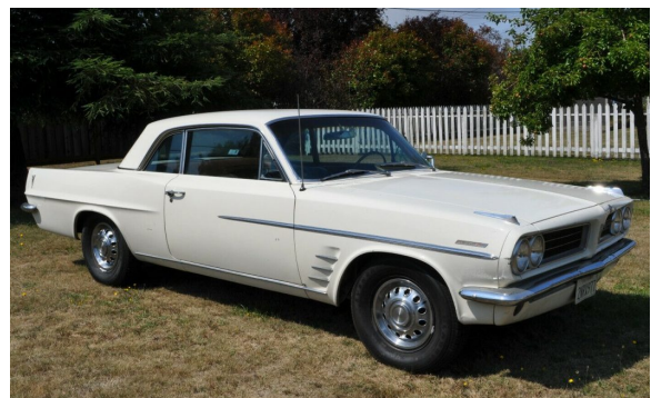
1963 Pontiac Tempest