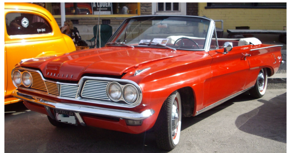
1962 Pontiac Tempest