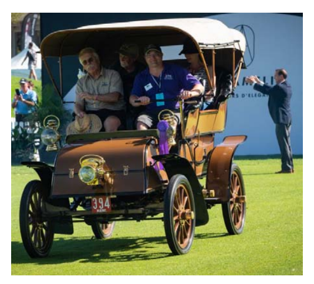
1904 Knox Tuxedo — Hagerty Drivers Foundation National Automotive Heritage Award