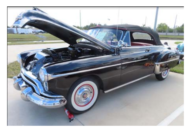
Dena Hold's 1950 Oldsmobile 88 convertible