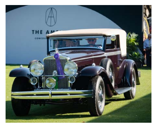
1933 Stutz DV- 32 Victoria Convertible — The Chairman's Choice Award