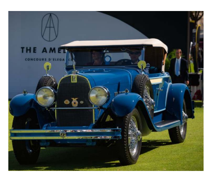
1929 DuPont Model G — Best in Class Waterhouse