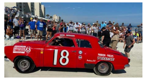
had a 127 mile Modified-Sportsman race.