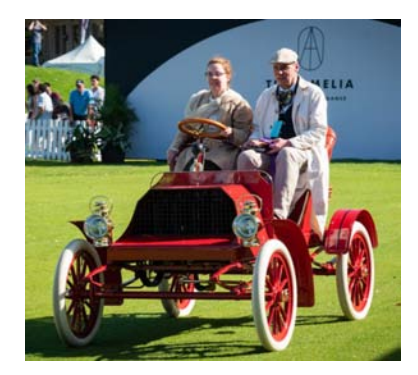
1903 Franklin A — The Tampa Bay Automobile Museum Award