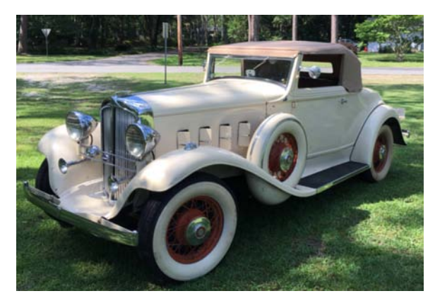
1932 Marmon Series 8-125 sold for $53,025 at Hemming Online Auction November 2021