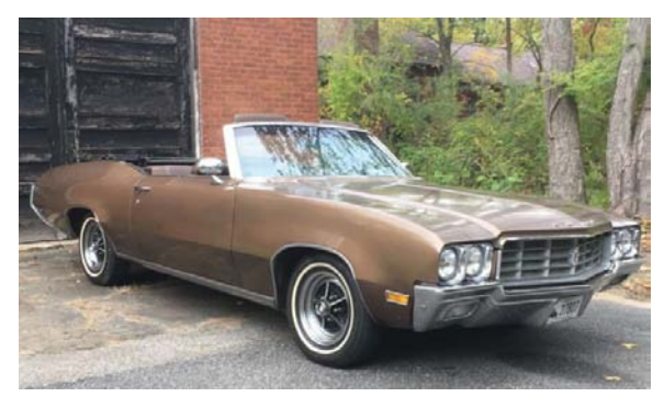
1970 Buick Skylark Custom sold for $16,275 at Hemming Online Auction November 2021