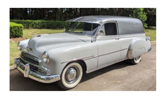
1951 Chevrolet Styleline DeLuxe Sedan Delivery Sold for $18,113 at Hemming Online Auction November 2021