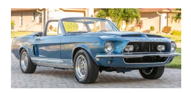
1968 Ford Mustang Shelby GT500KR Sold for $179,550 at Hemming Online Auction November 2021