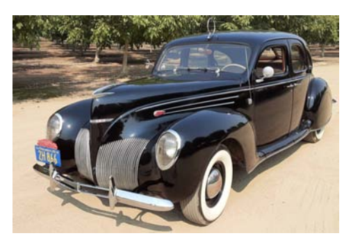
1939 Lincoln-Zephyr Sold for $21,263 at Hemming Online Auction November 2021