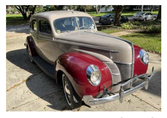
1940 Ford DeLuxe Fordor Sedan Sold for $14,175 at Hemming Online Auction November 2021

1967 Pontiac Grand Prix Sold for$19,163 at Hemming Online Auction November 2021