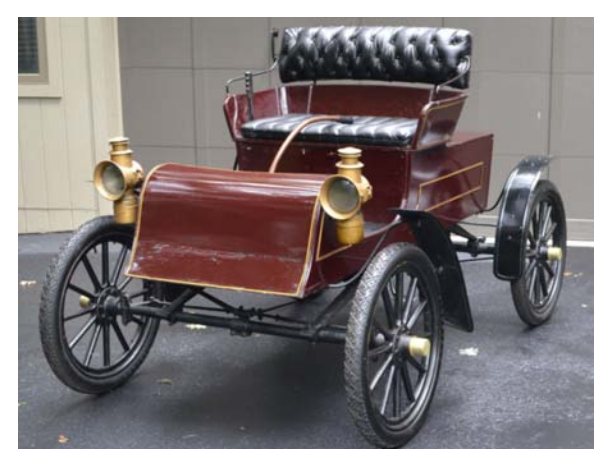
1902 Northern Sold for $34,125 at Hemming Online Auction November 2021