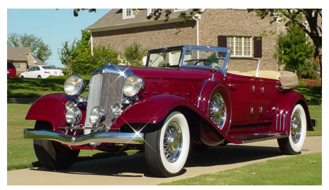
1933 Chrysler Imperial Imperial LeBaron

Published Monthly in the Interest of the Preservation of Antique Motor Vehicles