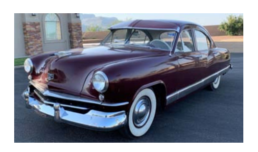
1951 Kaiser Special Sold for $10,000 at Hemming Online Auction November 2021

1967 Pontiac Grand Prix Sold for$19,163 at Hemming Online Auction November 2021