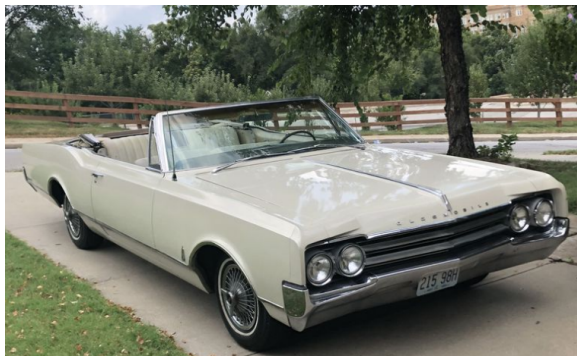
1965 Oldsmobile Dynamic 88 sold for $14,700 at Hemming Online Auction September 2021