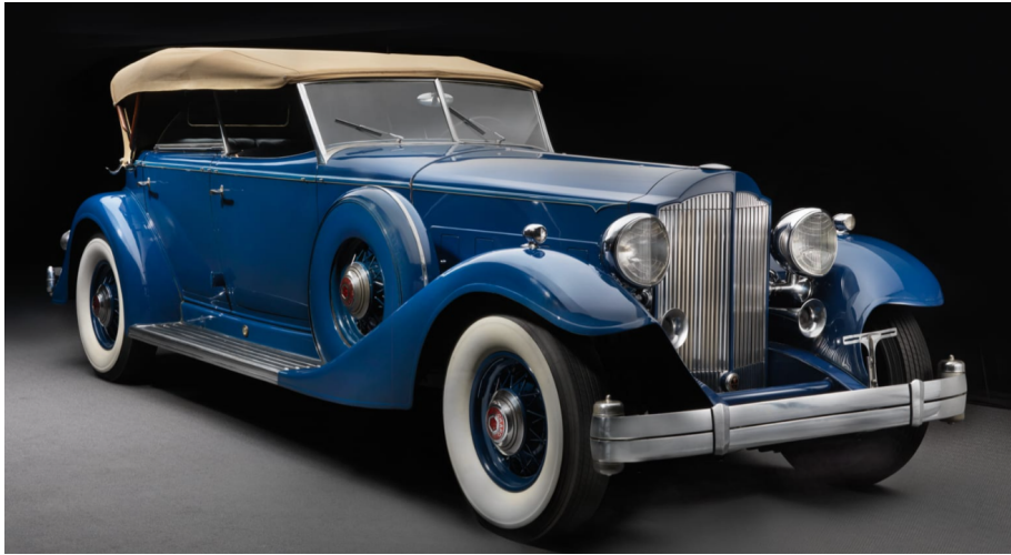
1933 Packard Twelve Dual Cowl Sport Phaeton

Published Monthly in the Interest of the Preservation of Antique Motor Vehicles