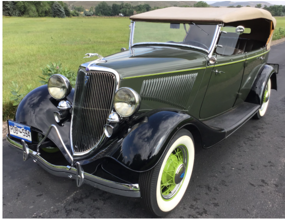
1934 Ford DeLuxe Phaeton sold for $44,100 at Hemming Online Auction September 2021