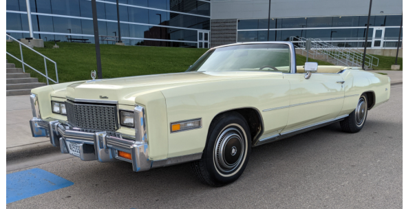
1976 Cadillac Eldorado Convertible sold for $16,538 at Hemming Online Auction September 2021