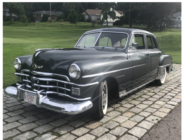
1950 Chrysler Windsor Four-Door Sedan Sold for $13,913 at Hemming Online Auction September 2021