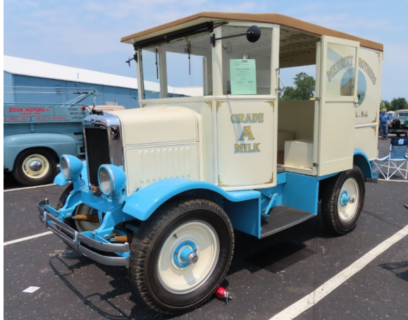
1927 Divco Milk Truck, Detroit Industrial Vehicles Company