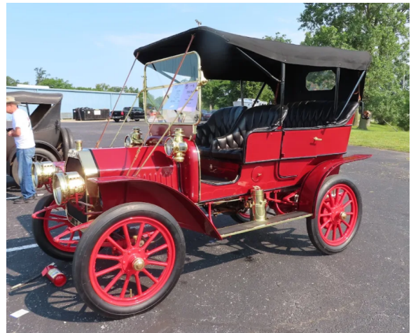
1910 Buick Touring