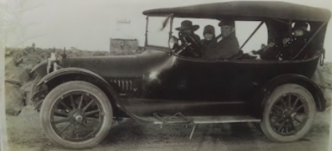
August, 1917 ~ Summit of Pike's Peak