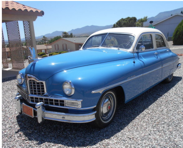
1950 Packard Super Deluxe Eight

Published Monthly in the Interest of the Preservation of Antique Motor Vehicles