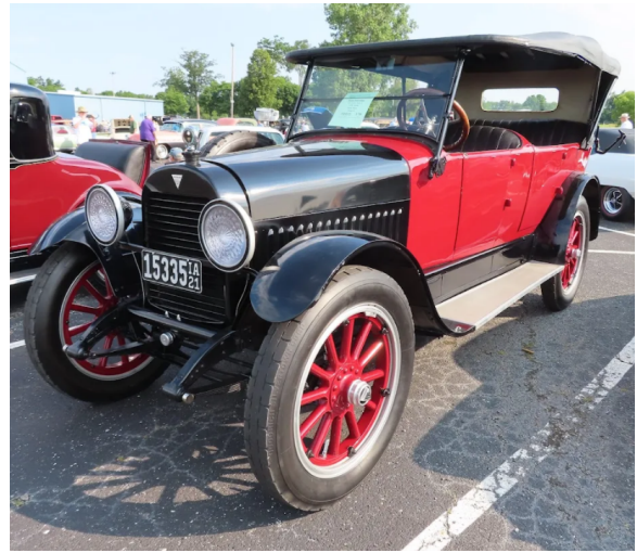
1921 Hudson Super 6 Touring