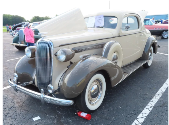
1936 Buick Special