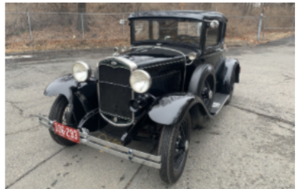
1931 Ford Model A DeLuxe Coupe Sold for $17,220 Hemmings Auction online March 2021