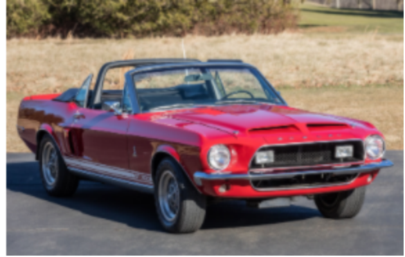
1968 Ford Mustang Shelby GT500 Sold for $150,000 Hemmings Auction online March 2021