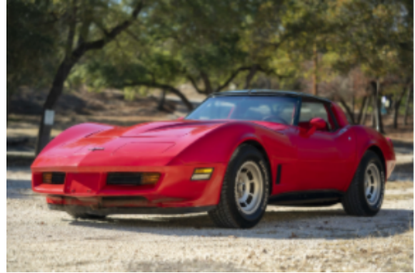
1981 Chevrolet Corvette Sold for $12,915 RM | Hemmings Auction online March 2021