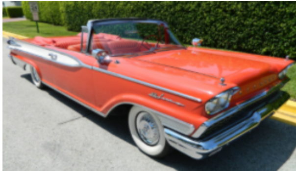
1959 Mercury Parklane

Published Monthly in the Interest of the Preservation of Antique Motor Vehicles