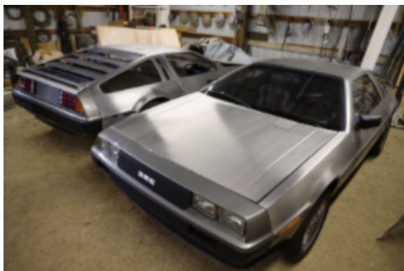
1,623-Mile and 14-Mile 1981 DMC DeLoreans with Consecutive VINs Sold for $57,750 Hemmings Auction online March 2021