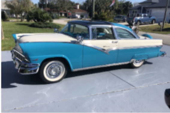
1956 Ford Fairlane Crown Victoria Skyliner Sold for $50,400 Hemmings Auction online February 2021