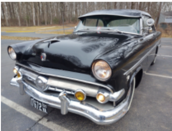
1954 Ford Crestline Victoria Hardtop Sold for $12,075 Hemmings Auction online March 2021