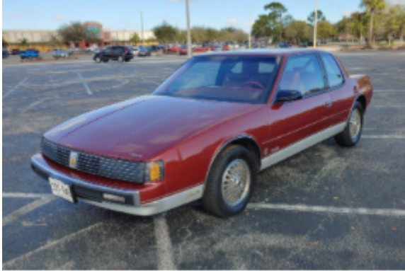
1986 Oldsmobile Toronado Sold for $5,500 Hemmings Auction online March 2021