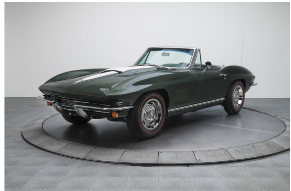
1967 CHEVROLET CORVETTE 427/435 CONVERTIBLE Sold for $99,000 Barrett Jackson Auction online July 2020