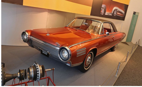
1963 Chrysler Turbine