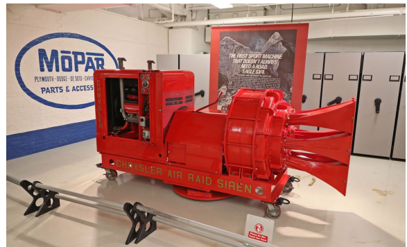
1956 Chrysler Air Raid Siren (Powered by a Hemi youtube )