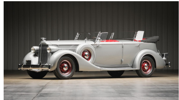
1935 Packard 1201 Dual Cowl Sport Phaeton Sold for $176,000 Worldwide Auctioneers Auburn September 2020