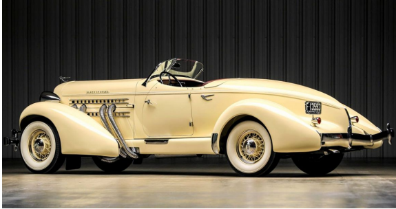
1935 Auburn 851 SC Boattail Speedster Sold for $1,045,000 Worldwide Auctioneers Auburn September 2020