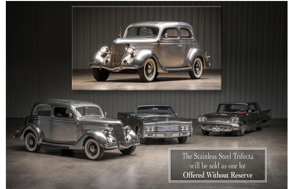
1936 Ford Deluxe Tudor Sedan Sold for $1,045,000 Worldwide Auctioneers Auburn September 2020