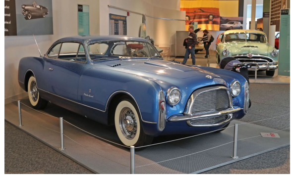
1953 Chrysler Special by Ghia