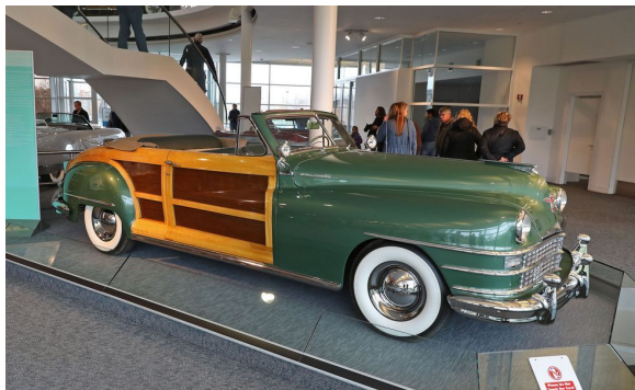
1948 Chrysler Town & Country Convertible