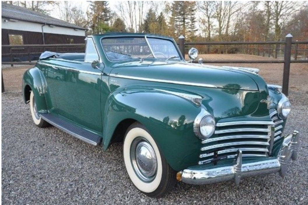
1941 Chrysler Windsor 4.0 Cabriolet

Published Monthly in the Interest of the Preservation of Antique Motor Vehicles