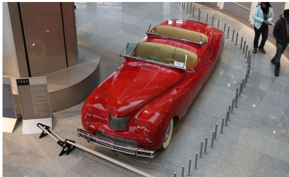
1941 Chrysler Newport