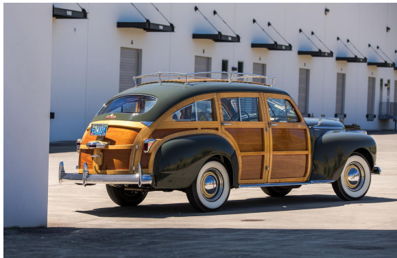
1941 Chrysler Town & Country "Barrelback" Station Wagon Sold for $286,000 Worldwide Auctioneers Auburn September 2020