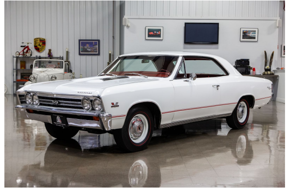
Four-Speed 1967 Chevrolet Chevelle SS 396t Sold for $52,000 Hemmings Auction online September 2020