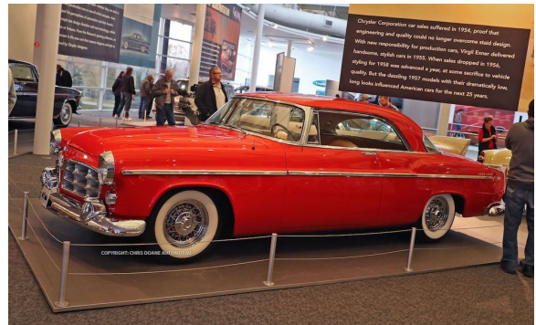
1955 Chrysler C-300