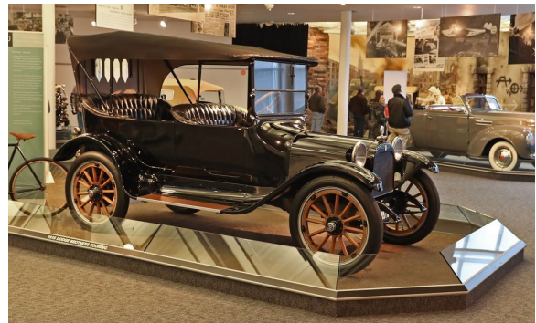
1915 Dodge Brothers 30-35 Touring Car

Here are some of the classic cars that were on display at the Walter P. Chrysler Museum on the grounds of the company's Auburn Hills, Michigan, headquarters opened to the public in 1999. The museum housed as many as 67 of the company's more interesting production, concept, and racing cars in a sprawling 55,000-square-foot facility with three floors and a rotating center display tower. The building, says FCA, will now be converted to badly needed office space.