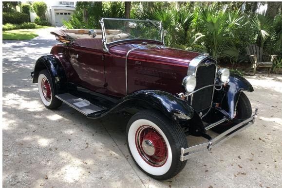
1931 Ford Model A Rumble Seat Roadster Sold for $27,300 Hemmings Auction online September 2020