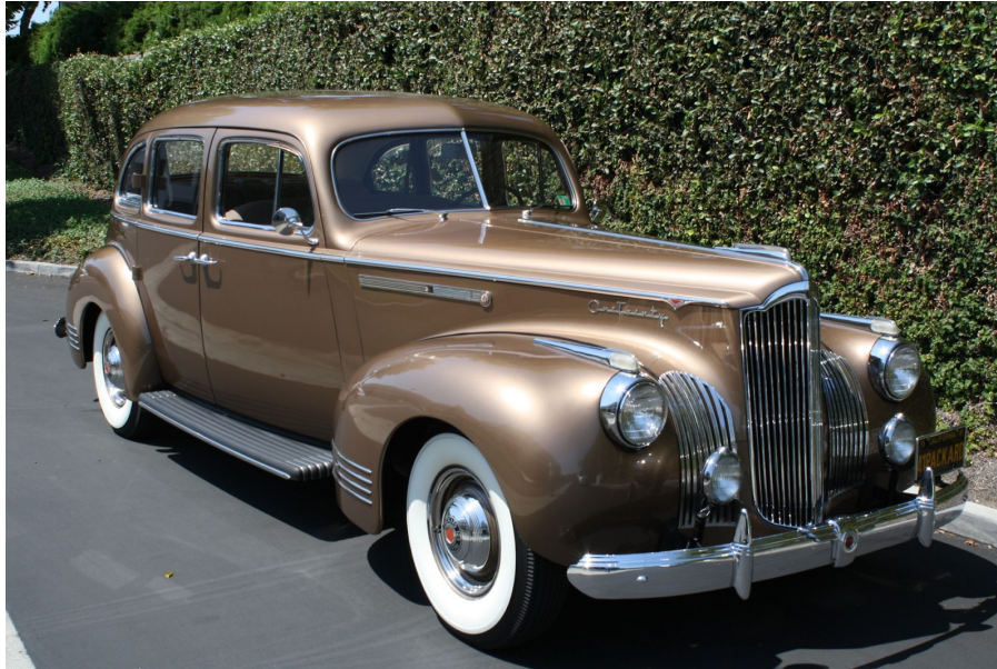
1941 Packard 120 Sedan

Published Monthly in the Interest of the Preservation of Antique Motor Vehicles