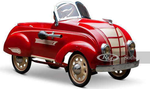
Chrysler Airflow, ca. 1935 Sold For $6,600 Sotheby's Online Auction June 2020