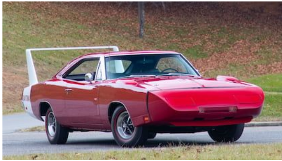
1969 DODGE DAYTONA Sold for $231,000 Mecum Auction June 2020