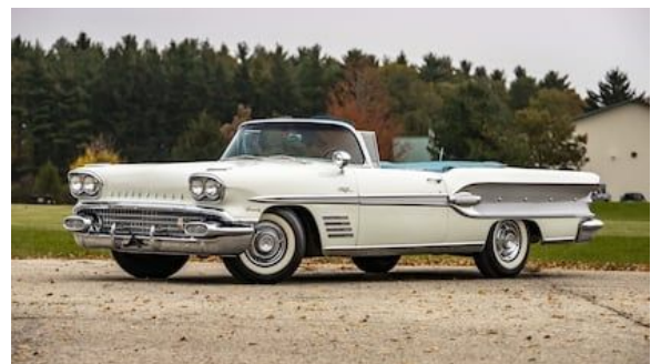
1958 Pontiac Bonneville Convertible Sold for $91,300 Mecum Auction July 2020