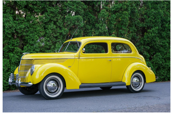
1938 Ford Model 81A Tudor Sedan Sold for $23,625 Hemmings Auction online July 2020