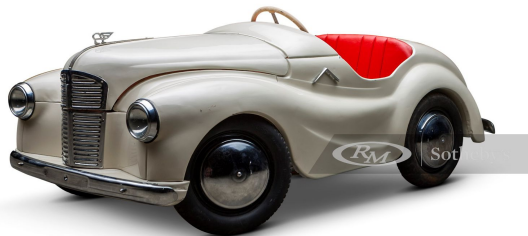
Junior Forty 'J40' Roadster, ca. 1955 Sold For $9,900 Sotheby's Online Auction June 2020