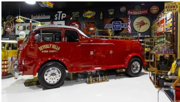
1941 KENWORTH FIRE TRUCK Sold for $209,000 Mecum Auction June 2020