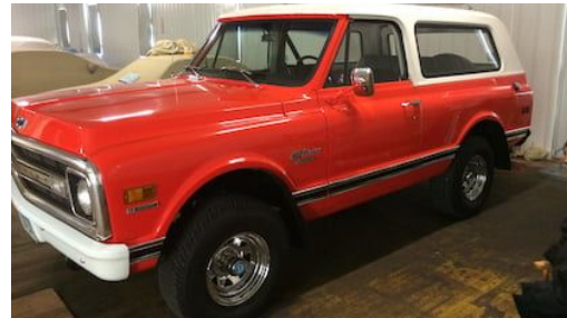
1970 CHEVROLET BLAZER Sold for $31,350 Mecum Auction June 2020