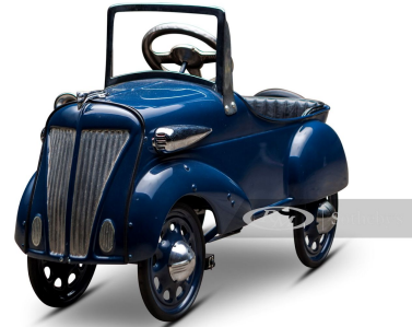
Ford Roadster, 1936 Sold For $1,920 Sotheby's Online Auction June 2020