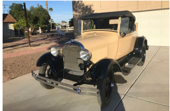
1929 Ford Model A roadster, sold at Scottsdale 2020 Jackson-Barrett auction for $14300