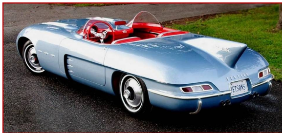
1956 PONTIAC CLUB DE MER