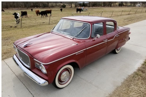
1959 Studebaker Lark, sold at Scottsdale 2020 Jackson-Barrett auction for $4400