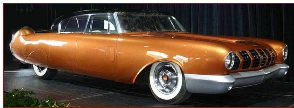
195? MERCURY D524