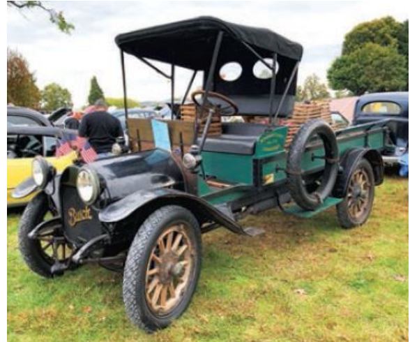
1915 Buick Model C-4 Express Truck