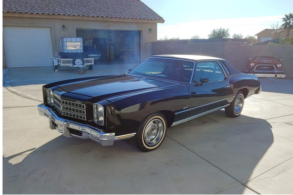
1976 Chevy Monte Carlo, sold at Scottsdale 2020 Jackson-Barrett auction for $11000