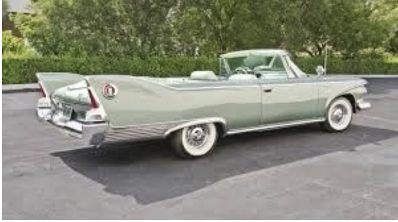
1960 Plymouth Fury Convertible