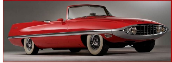
1957 CHRYSLER DIABLO