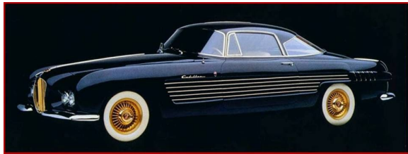
1953 CADILLAC GHIA COUPE