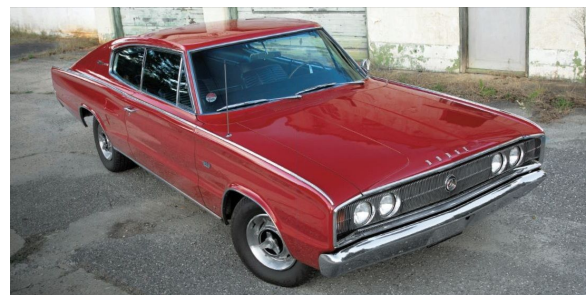
1966 Dodge Charger