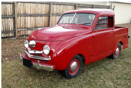
1949 Crosley CC Pickup, sold at Scottsdale 2020 Jackson-Barrett auction for $8800