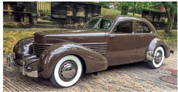
1936 Cord 810 Beverly