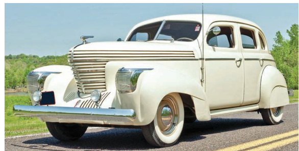
1939 Graham Series 97, sold at Mecom Kansas City auction for $22500