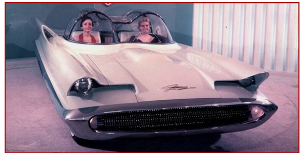
1955 LINCOLN FUTURA