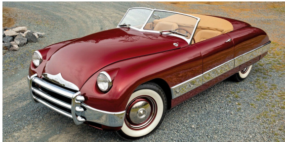
1949 Kurtis Sports Car

It is all quiet on the streets of Orlando these days which makes it hard to run across many interesting cars these days. So instead, here are some cars I would love see on the streets: