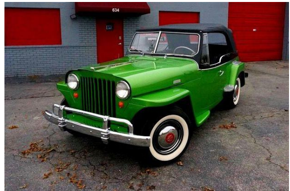
1947 Willys Jeepster, sold at Scottsdale 2020 Jackson-Barrett auction for $9900