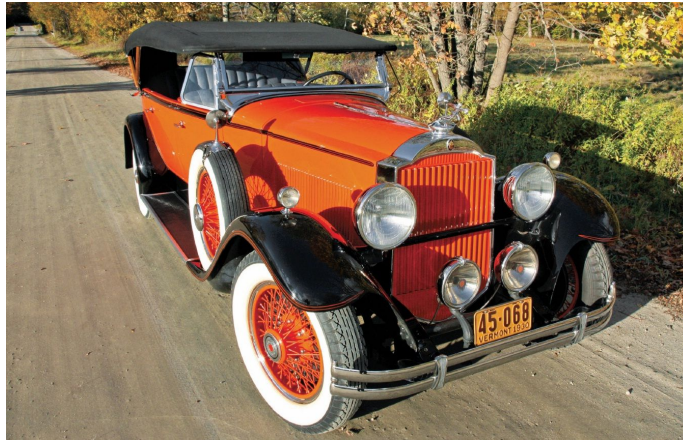
1930 Packard Standard Eight

Published Monthly in the Interest of the Preservation of Antique Motor Vehicles