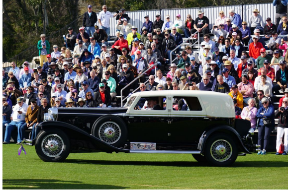
Best in Show, Concours d'Elegance: 1929 Duesenberg J Town Limousine – Lehrman Collection, Palm Beach, Florida