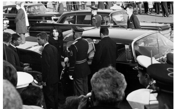
First Lady Jacqueline Kennedy rode in her personal Crown Imperial limousine in her husband's funeral procession.