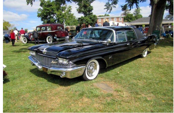
1960 Chrysler Imperial with a 20-inch stretch, designed and built in Italy by Ghia for Gov. Nelson A. Rockefeller of New York