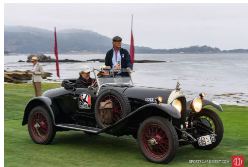
Bentley 3 Litre Park Ward S 192 speed Model