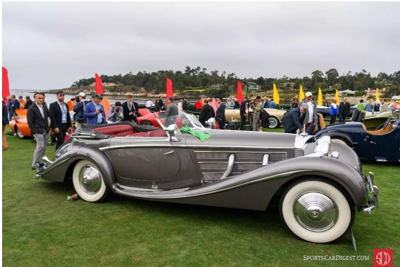
1936 Mercedes-Benz 540K Erdmann and Rossi Special Cabriolet