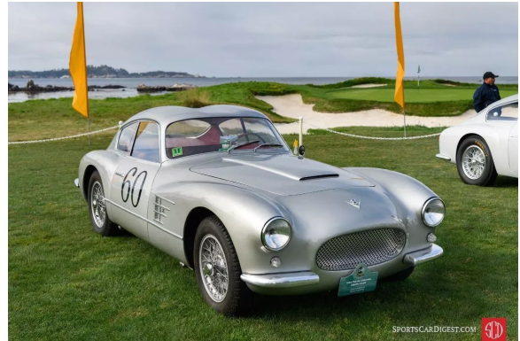
1954 Fiat 8V Elaborata Zagato Coupe