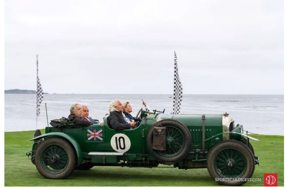
100th Anniversary of Bentley was featured at the 2019 Pebble Beach Concours d'Elegance