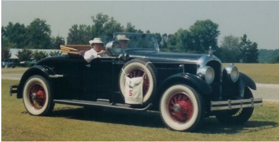
1927 Marmon Model E-75

Published Monthly in the Interest of the Preservation of Antique Motor Vehicles