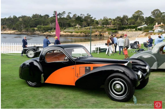
1936 Bugatti Type 57S Atalante Coupe