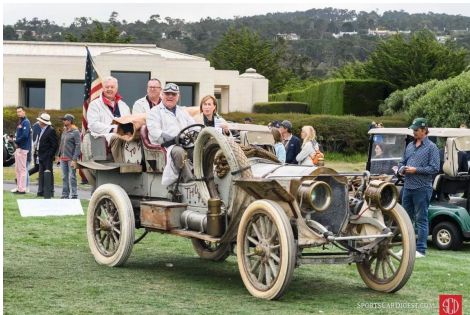
Thomas Flyer New York to Paris