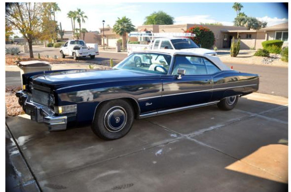
1974 Cadillac Eldorado convertible sold for $12,100.00 Scottsdale 2019 Jan