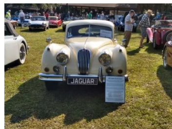
1956 Jaguar XK 140 Coup