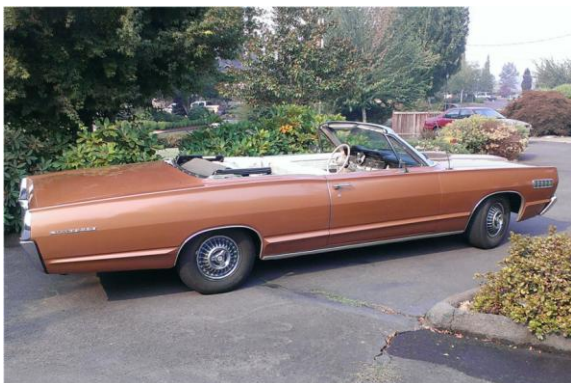
1967 Mercury Monterey convertible sold for $4,070.00 Scottsdale 2019 Jan