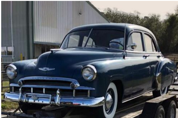
1949 Chevrolet 4-door sedan Sold for $5,500.00 Barrett-Jackson April 2019 Palm Beach