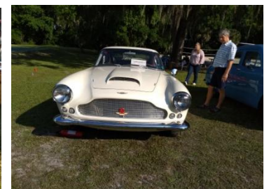
Aston Martin DB6