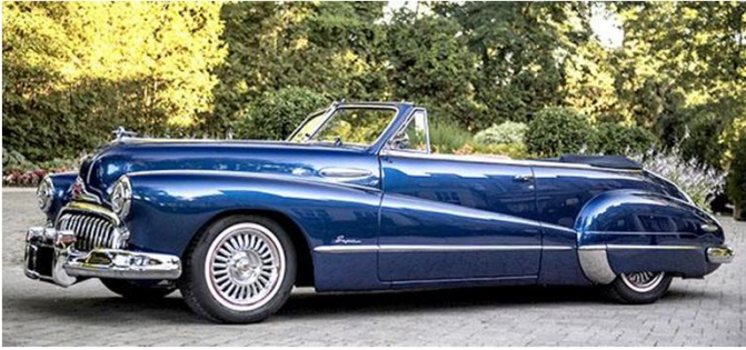
1947 Buick Super 8 Custom Convertible: Sold for $412,500 Barrett-Jackson April 2019 Palm Beach

Palm Beach, FL -- Barrett-Jackson April 2019 Palm Beach sale