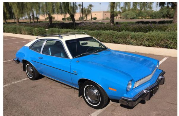
1974 Ford pinto hatchback Sold for $18,150.00 Scottsdale 2019 Jan