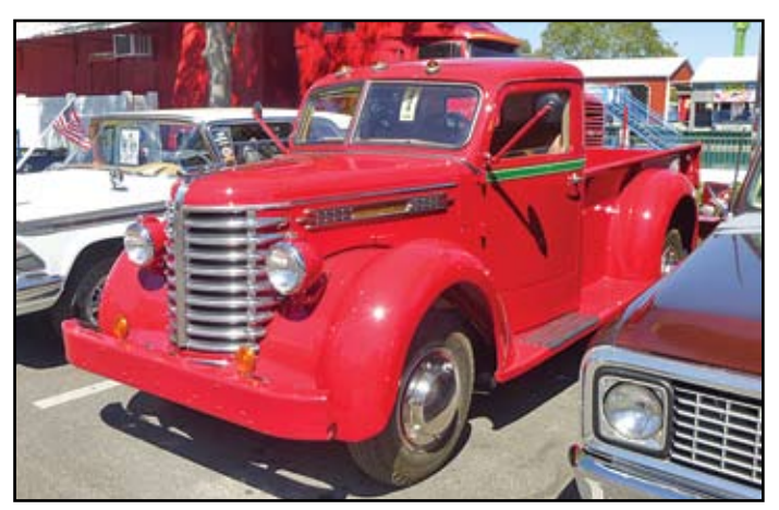
A 1948 Ford Truck, Cab Over Engine