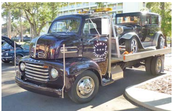
1956 Mercury Montclair 2 Door Hardtop, 312 cubic inch V–8 engine with 235 horsepower. Color is Persimmon and White continued on Page 8