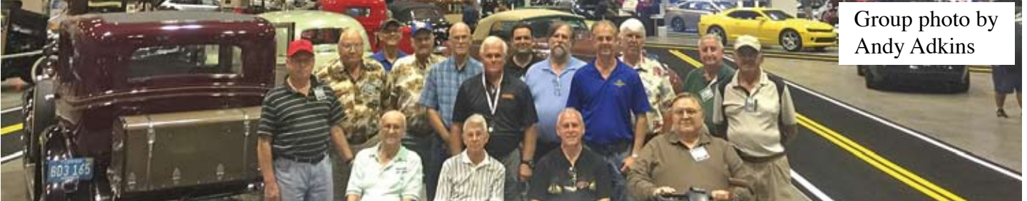
Group