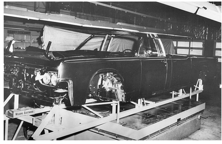
Removable Transparent Top Sections Stored in Trunk

The Hess & Eisenhardt Company of Cincinnati, Ohio, transformed a stock 1961 Lincoln Continental convertible into the presidential limousine. The firm stretched the car by 3 1/2 feet, added steps for Secret Service agents, and installed a siren, flashing lights, and other special accessories. The customization took approximately six months and the car arrived at the White House in June 1961.