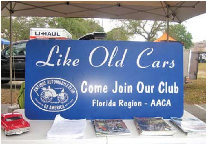
Florida Region Booth at the Car Show