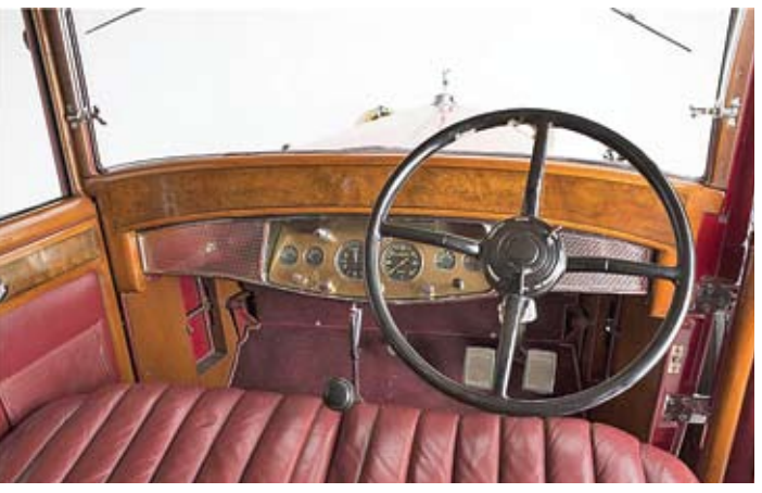
SOURCE: Photos & Text from http://www.barrett-jackson.com/Archive/Event/Item/1930-CADILLAC-V-16-LANDAULETTE-DE-LUXE-180517