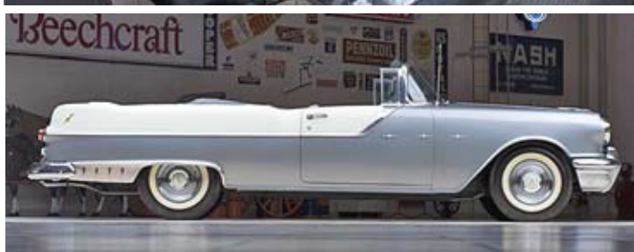
SOURCE: Photos & Text from http://www.barrett-jackson.com/Archive/Event/Item/1955-PONTIAC-STAR-CHIEF-CONVERTIBLE-178559