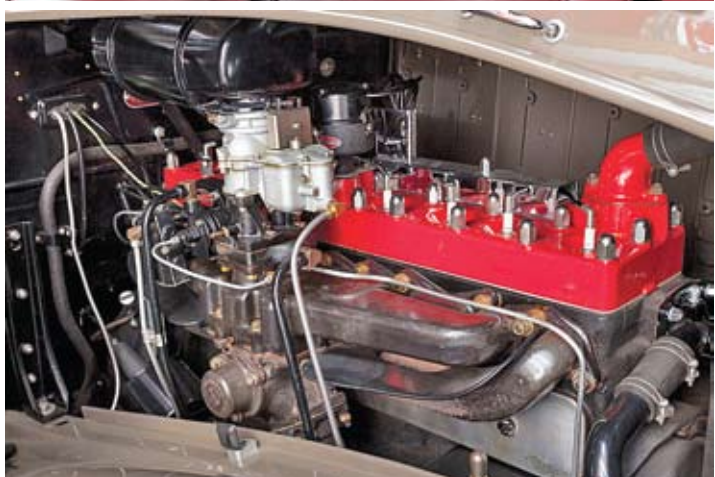
Photos and text from: http://www.rmauctions.com/lots/lot.cfm?lot_id=1069937