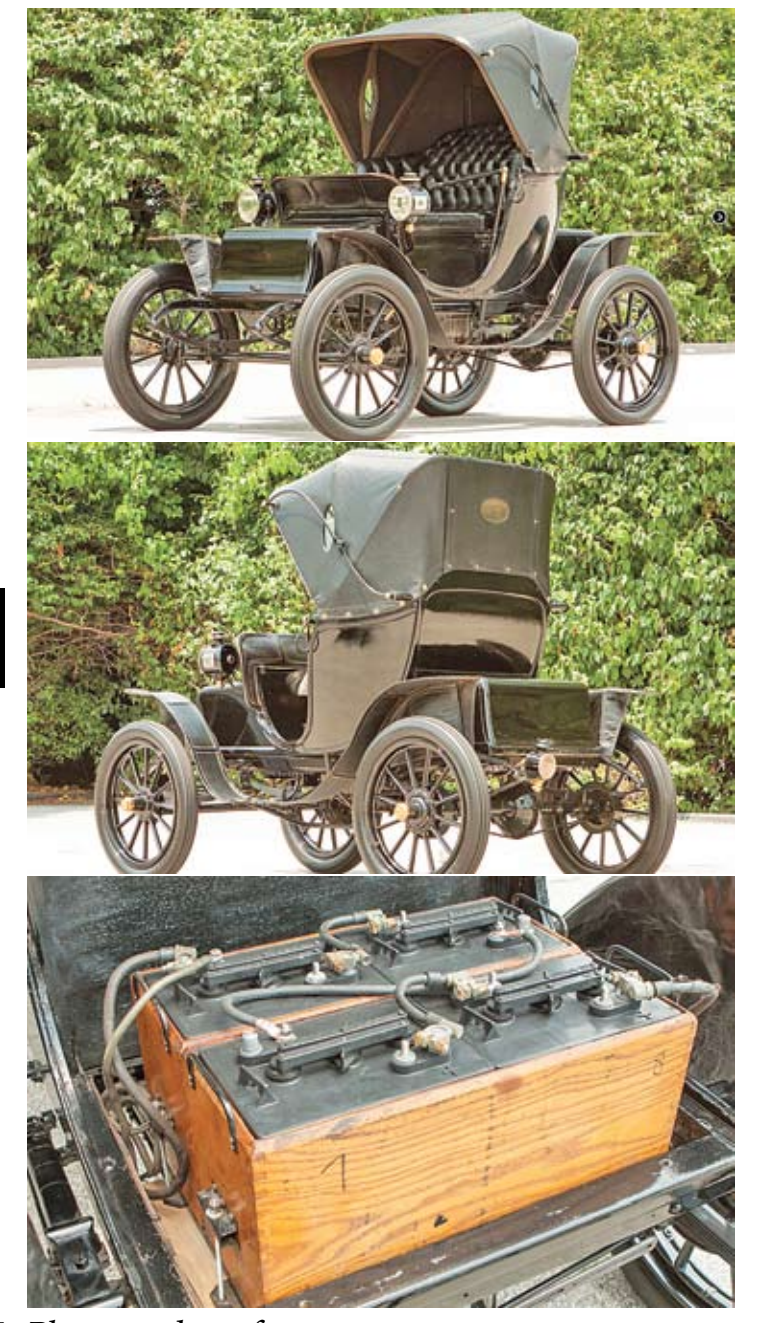
Photos and text from: http://www.rmauctions.com/lots/lot.cfm?lot_id=1069953

2.5 hp, 48-volt electric motor with shaft drive to the rear wheels, front and rear semi-elliptic leaf spring suspension, and rear wheel brakes. Wheelbase: 80 in, driving range of 40–50 miles.