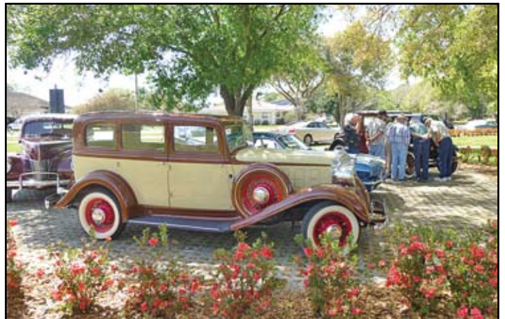
Secret Lake Park in Casselberry, FL was a beautiful setting for antique cars to gather.