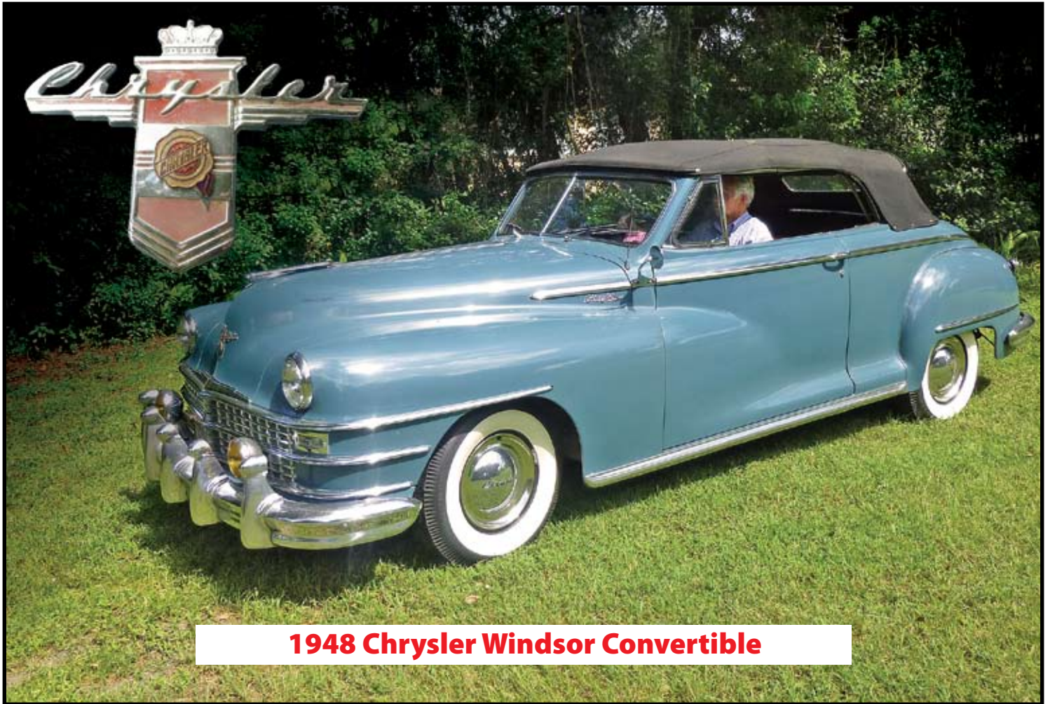
1948 Chrysler Windsor Convertible