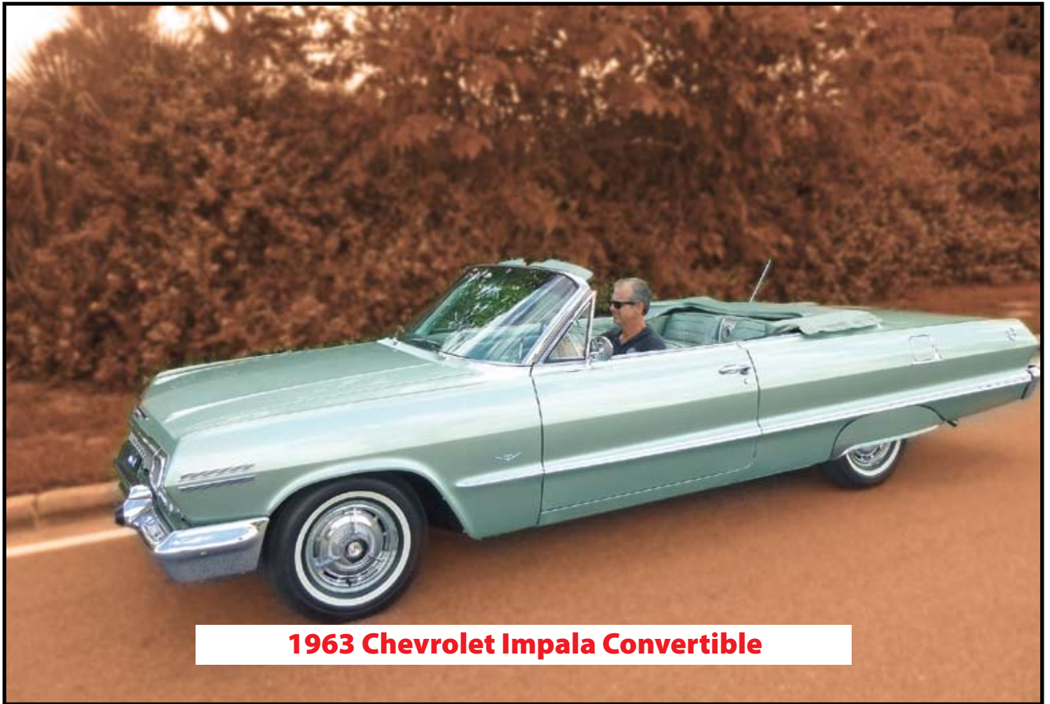
1963 Chevrolet Impala Convertible