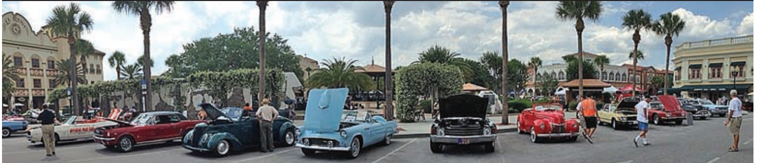
200 cars attended The Villages downtown cruise area. The gazebo in the background had a live 3 piece band