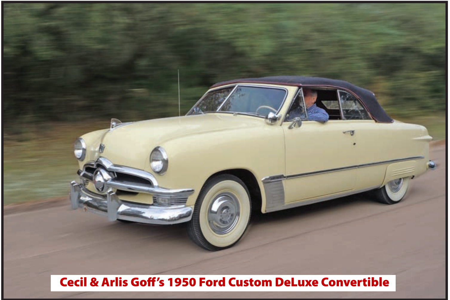
Cecil & Arlis Goff's 1950 Ford Custom DeLuxe Convertible