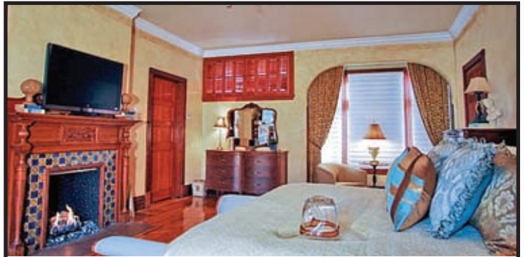
One of the eight bedrooms in the 3 story Mansion

inventor and his family spent the winter months in the Mansion. In it’s heyday, Stetson hosted famous guests like John B. Astor, the Vanderbilts, King Edward VII and the 22nd U.S. President Grover Cleveland.