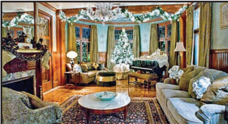
First floor Sitting Room next to the front entrance