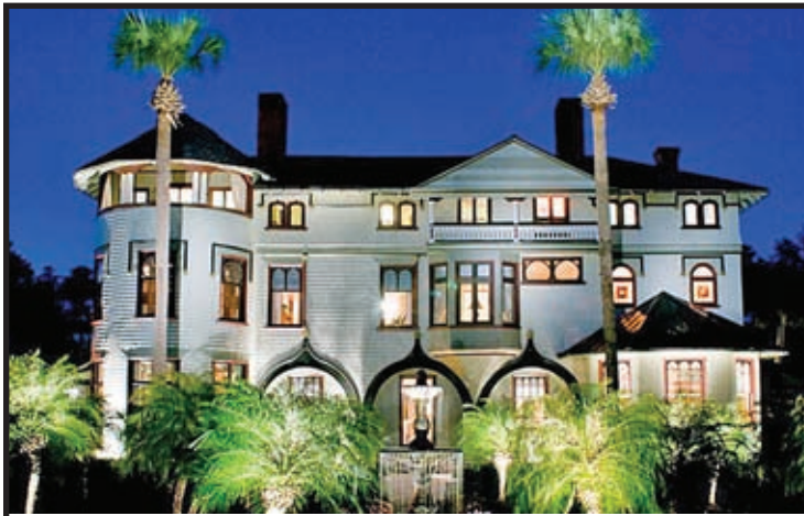
The Stetson Mansion at night