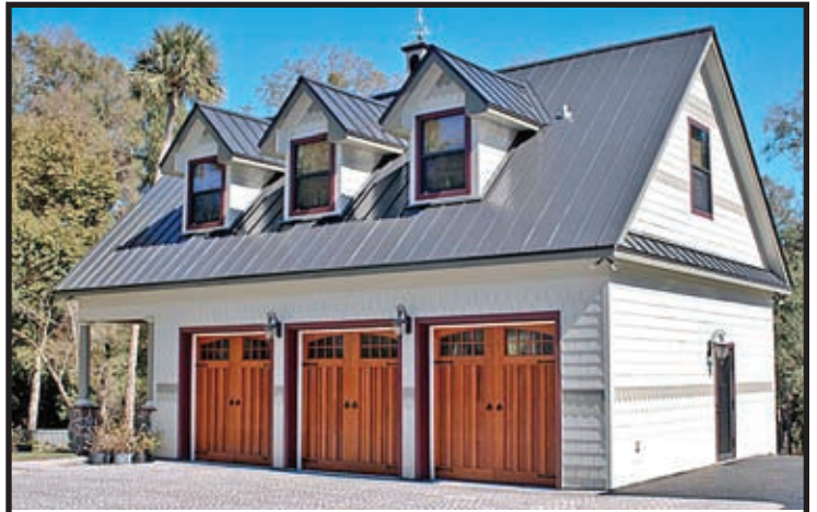
2 story, 3 car garage located next to the Mansion

The Mansion was Florida’s first luxury home and the first home in Florida to be built with electricity (Edison Direct Current). It has several original Edison electric light fixtures and the original Edison electric fuse box. Deland was the first Florida city to use Edison’s electricity. The Mansion has 8 bedrooms, 13 bathrooms, several kitchens and 6 fireplaces. Built-in closets were rare in the 19th century homes because they were taxed as separate rooms.