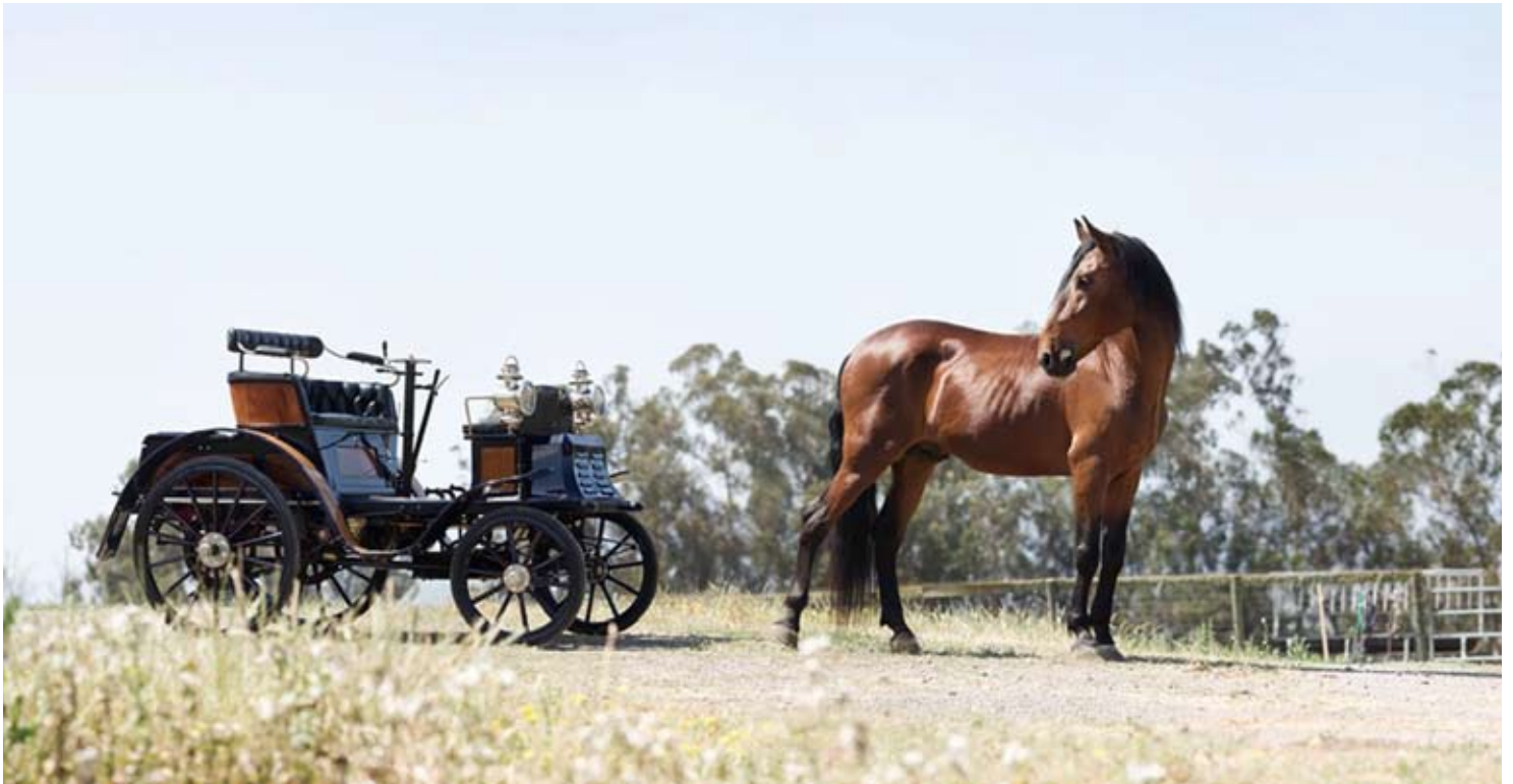
"1898 Mercedes Ideal"