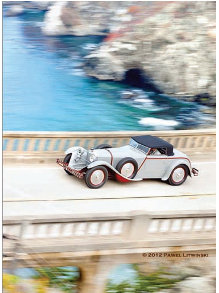
1928 Mercedes-Benz 680S Saoutchik Torpedo Best of Show, 2012 Pebble Beach Concours D'Elegance Photo taken August 16, 2012 in Big Sur, California

Respectfully submitted by Howard Gilkes Nominating Committee Chairman