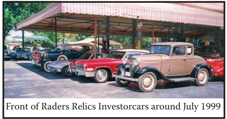
Front of Raders Relics Investorcars around July 1999

gas station at I-4 and Fairbanks was for 25 years Raders Relics Investorcars.